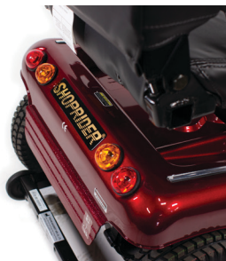
Optional lighting kit installed, must be installed at time of purchase.