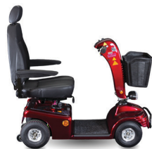
Side profile, front headlight standard on unit.